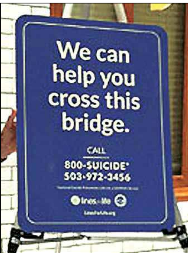
The new St. Johns Bridge sign may look something like the one designed for the Vista Bridge.