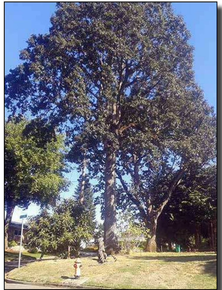
Above: Two Oregon oak at 6738 N. Mohawk Below: City warning recently attached to removal tape.