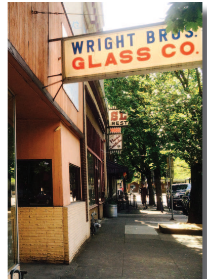
Above: The Wright Bros. sign that hung at 8649 N. Lombard for 36 years and another sign in their window saying good-bye.

The brothers will be dismantling the shop in a couple weeks after the closure. You still have time to stop by and say, thank you for good