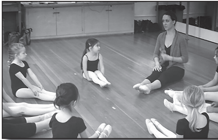
The Aspire Project has a new location at 8426 N. Lombard and offers classes on a sliding scale basis. See more at: www.theaspireproject.org .

To register for The Aspire Project spring classes (on a sliding scale basis,) start April 4 and runs through June 12, 2015. Register at: www.theaspireproject.org or call 503-505-0382.