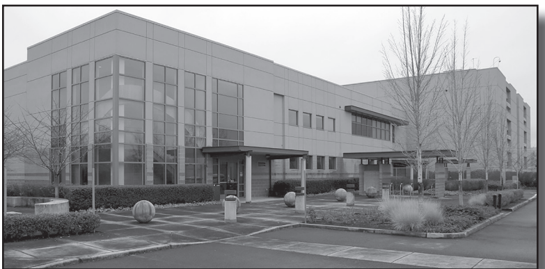
The front of the Wapato Jail

In concrete terms, their projects include: providing support and a gallery for a Blue Moon Staff Show, a collaboration with Pulp and Deckle, and NW Film Center