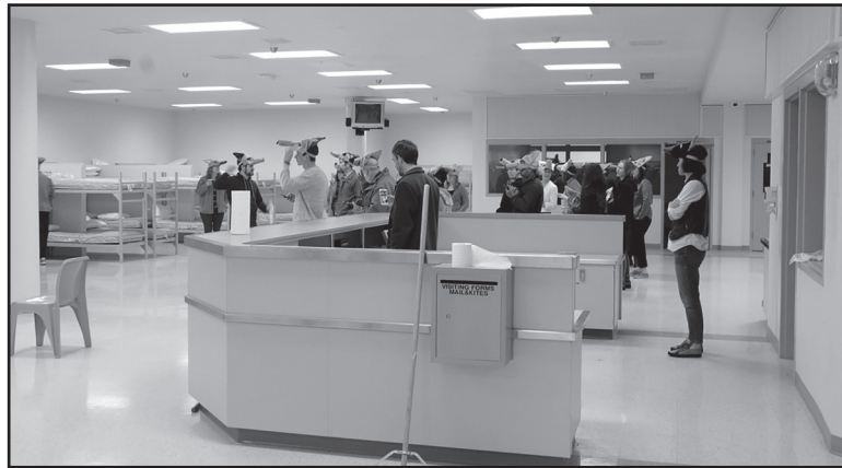
Extras given tour of a dormitory of a area.

Another project, under the umbrella of "Artists in Residence," is a collaboration since 2013 with