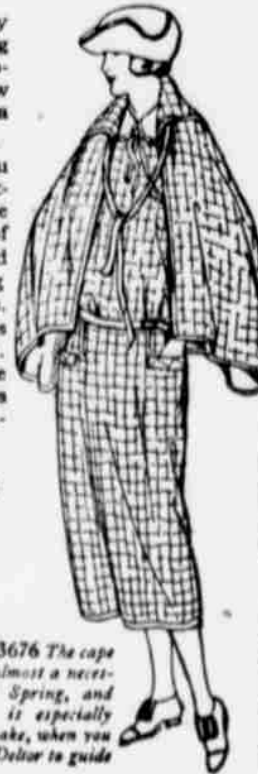
Design 3676 The cape dress is almost a necessity this Spring, and this one is especially easy to make, when you have the Deltor to guide you.