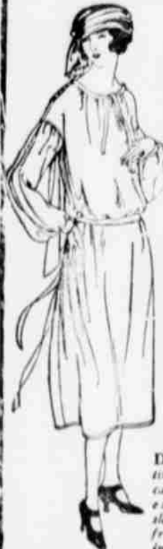
Design 3641 A tiny, independent cape and picture-appeal slashed skirt make this frock especially interesting.

Five hundred designs for the new Spring season are at the pattern counter