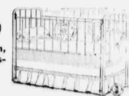
Simmons' Steel Crib

$12.75, $4.00 Down, $1.00 Week as illustrated