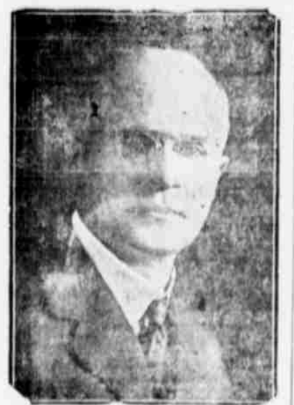
Republican Candidate For County Clerk If I fail to reduce the annual expense of the office by from $5000 to $10,000 or to give as prompt and efficient service, I will donate one-half of my salary for two years to the Red Cross Fund. Paid adv.