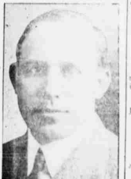
Republican Candidate for Labor Commissioner Will foster industries and protect investments. Will give Employer and Employee a square deal. Primaries May 17, 1918. Paid adv.