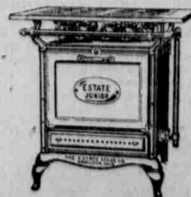
Estate Junior. Price $14.00 Terms: $1 Down $1 per Mo.