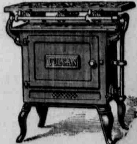
No. 60-16 Vulcan. Price $14.00 Terms: $1.00 Down $1.00 per Mo.