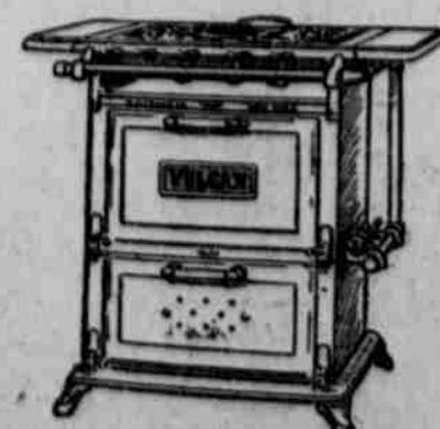
No. 835 Vulcan. Price $24.00 Terms: $4 Down $1 per Mo.