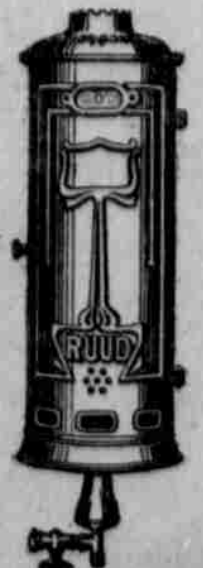
No. 25 Ruid Water Heater. Price $16.00 Terms: $4 Down $1 per Mo.