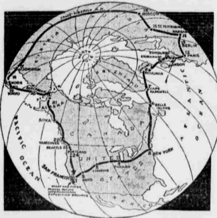
AIRSHIPS WILL RACE AROUND THE GLOBE FROM SAN FRANCISCO IN 1915.

Every phase of the exposition is far advanced. Thirty-four of the world's nations will participate with government displays, Argentina leading with a government appropriation of $1,000,000 gold.