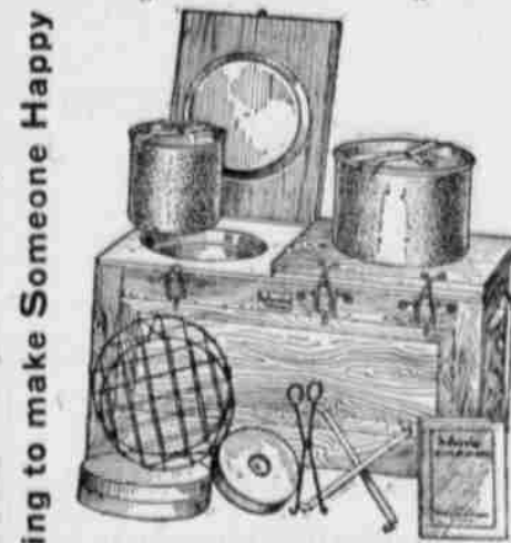
MEN—Buy your wife a Caloric Fireless Cooker for Christmas. The most pleasing gift you could buy for her. Call while stock is complete. From $10 to $36.

This year we are showing the most complete line of Christmas goods, and can please the most discriminating. No trouble to show goods. PIANO VOTES GIVEN WITH EVERY CENT PURCHASE.