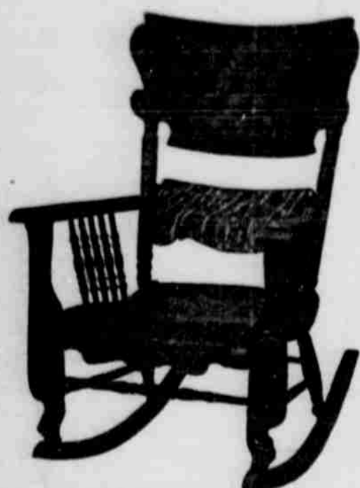
Good Solid Oak Rockers that are worth from $5.50 to $8.50 Your Choice $5

We have a complete line of High Chairs Youth's Chairs Child's Rockers Sewing Rockers and Reception Chairs