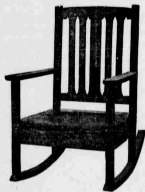
A LARGE OAK ROCKER Well Made Finished in Golden Wax Only $7.00