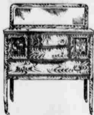
Quartered Oak Buffet with French plate glass Regular $25.00 Only $18.00

HAVING FINISHED INVOICING, we find a large number of odd pieces of furniture which we are closing out at greatly reduced prices.