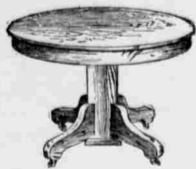
Six-foot Extension Table SOLID OAK A Bargain at $15.00 Only $10.00

HAVING FINISHED INVOICING, we find a large number of odd pieces of furniture which we are closing out at greatly reduced prices.