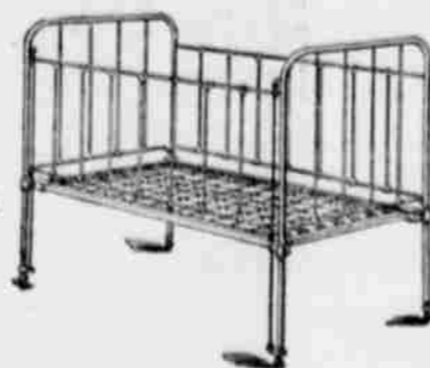
Iron Cribs with Springs from $5.00 up