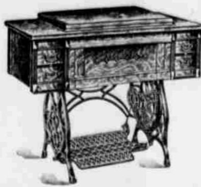
The Best Sewing Machine made for the money. Fully warranted. Pay $1.00 Weekly

Calef Bros. HOME FURNISHERS 501-03 JERSEY ST. ST. JOHNS, ORE.