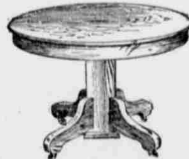
6-ft Extension Table, quartered oak finished $9.90

i. e., Satisfactory goods at lowest prices and easiest terms