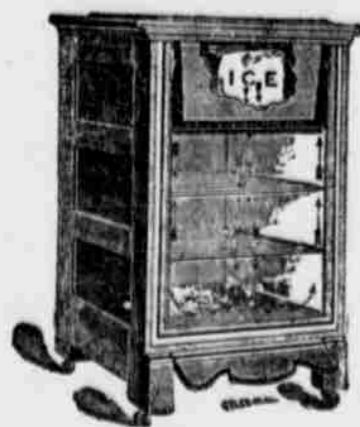
Cool, Clean, Sanitary, white Lined Refrigerators, will pay for themselves. $1.00 a week

Calef Bros. HOME FURNISHERS 501-03 JERSEY ST. ST. JOHNS, ORE.