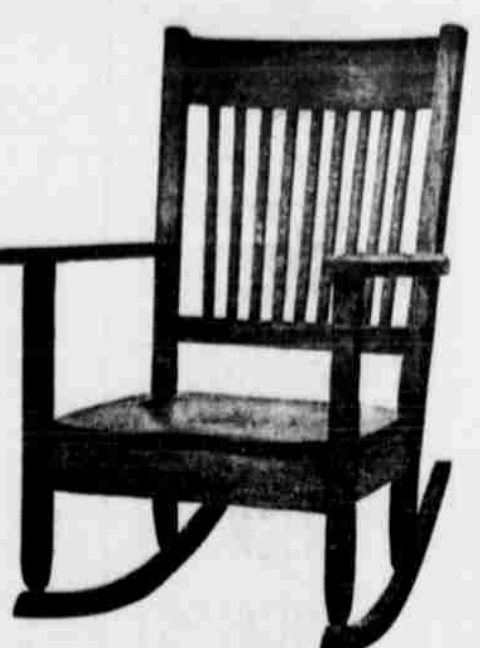
This Large Easy Chair

Also Roger Bros.' "1847" Silver Ware and Cut Glass Bowls, Fern Dishes, Water Sets, Creamers and Sugars, Jelly Dishes, etc. Xmas and Wedding Presents.