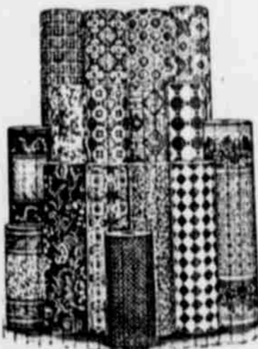
63 cents to $2.00 per yard

Ask your neighbors, they are using our goods