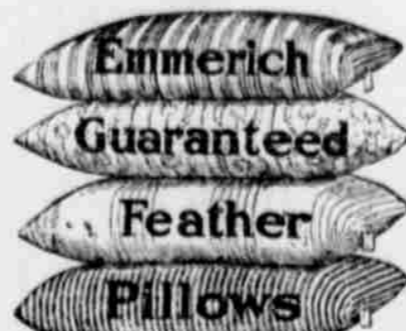
Every Emmerich Feather Pillow has attached the

Emmerich Pillows, Comforts, and Blankets