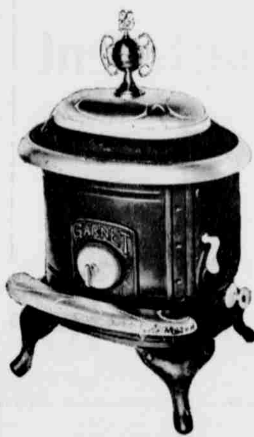
(MADE IN ST. JOHNS) Price - - $9.90