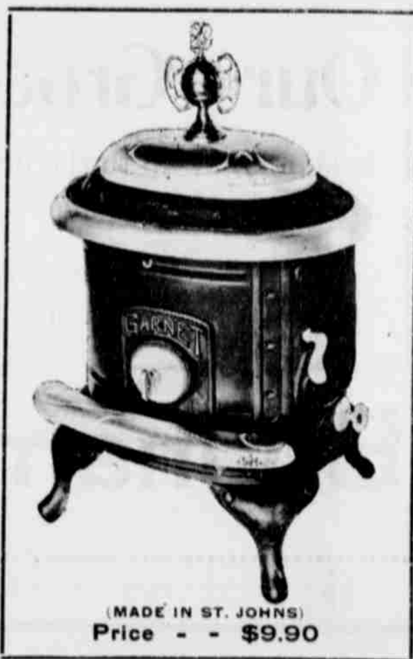
(MADE IN ST. JOHNS) Price - - $9.90