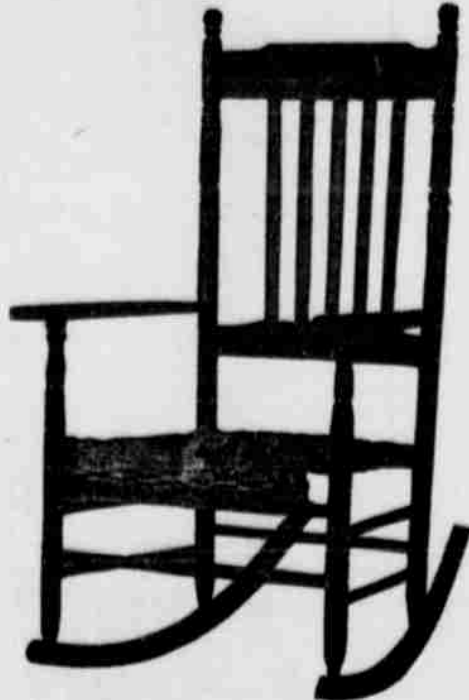
Rockers like cut, only $3.25