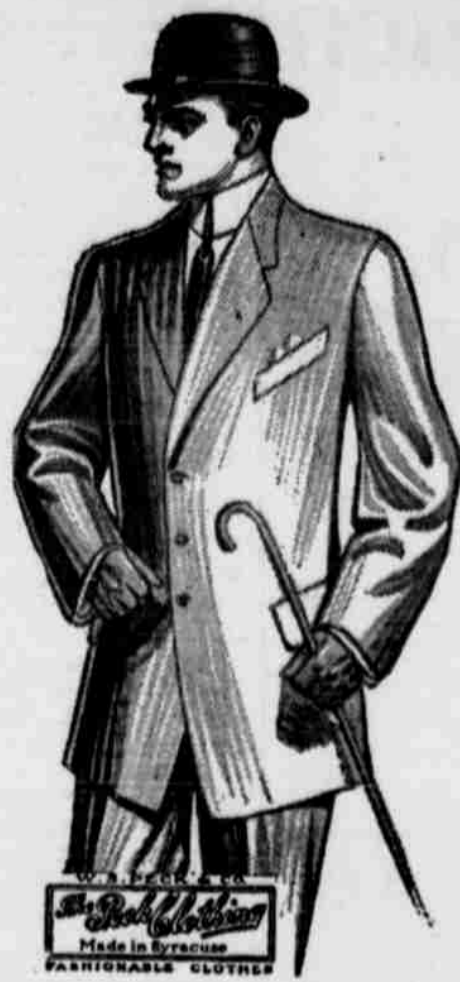
Made in Syracuse PATENTABLE CLOTHES

They come directly from the manufacturer to our store. We know they wear well. For they have been tried out for years. These, too, we guarantee.