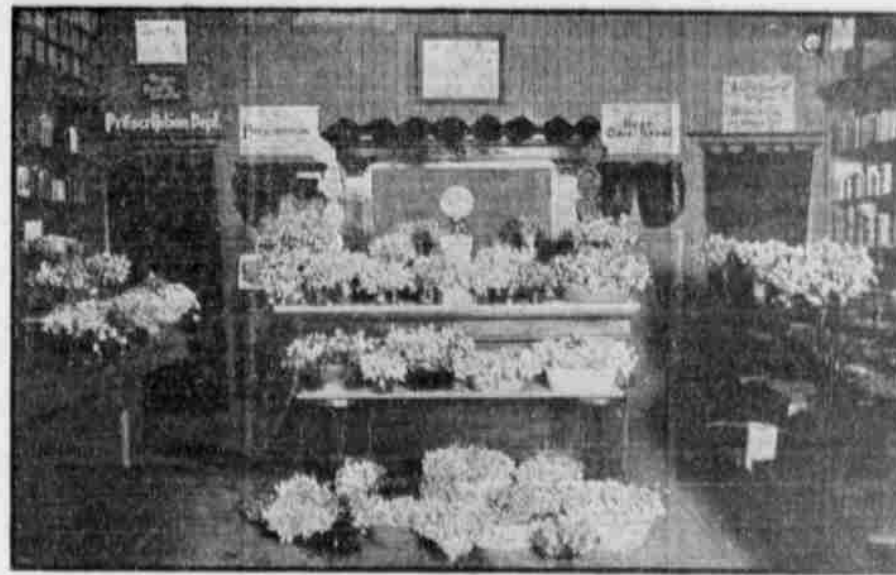
Last Year's Sweet Pea Blossom Exhibit at the North Bank Pharmacy

The Sweet Pea show which aroused so much interest last year will be repeated this year. It is proposed to conduct the exhibition on a more extensive plan, and it is believed that even greater interest will be excited than at our initial show last year. The date has not been set definitely, but will be announced in due time. In the meantime secure your seeds and "get in the race." Only the best seeds obtainable will be offered the public at this store.