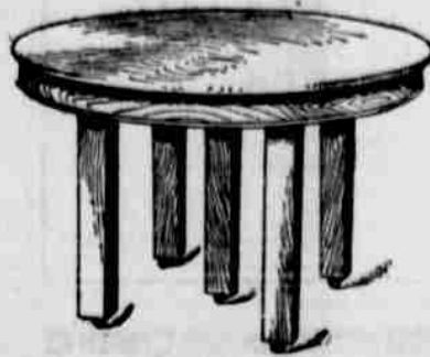
Extension Tables $5.00 to 38.00

The best refrigerator sold "THE WHITE FROST"