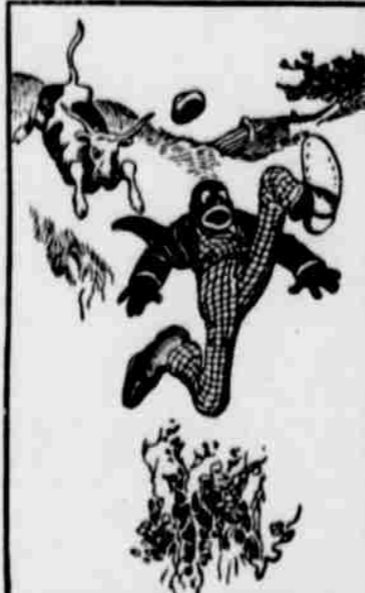
"TO HAVE A BULL TAKE AFTER YOU."

"My friends," said Brother Gardner of the Limekiln club after the routine business at the last regular meeting had been disposed of, "we have been dreamin' old dreams and seein' old signs fur a long time past. I think de time has come fur sunthin' new. If de cull'd race am gwine to keep up de pursession, den old things must be dun away wid. What cull'd folks