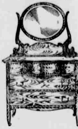
Dressers In fir, white maple, golden ash or mahogany finish. Birds' eye maple, oak and mahogany, $6.75 to $30.

SHADES—Any color. Hammocks. Good honest values.