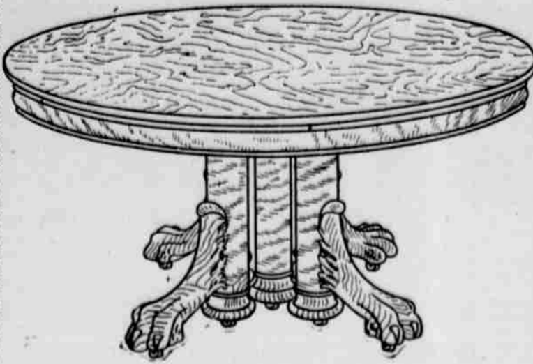
Round cornered, quarter sawed oak, 6-foot extension, 44 inch top, piano polished finish, like cut $32.50. Others from $6.00 to $38.75.