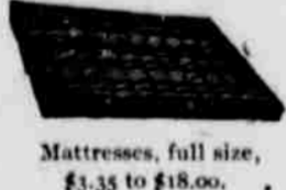
Mattresses, full size, $3.35 to $18.00.