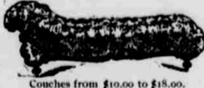
Couches from $10.00 to $18.00.