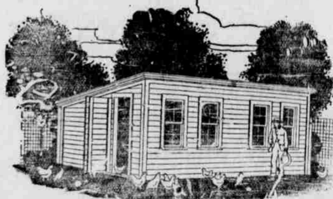
CHICKEN HOUSE—A GOOD INCOME CAN BE REALIZED UNDER THE OCHOCO PROJECT IN THE POULTRY BUSINESS.