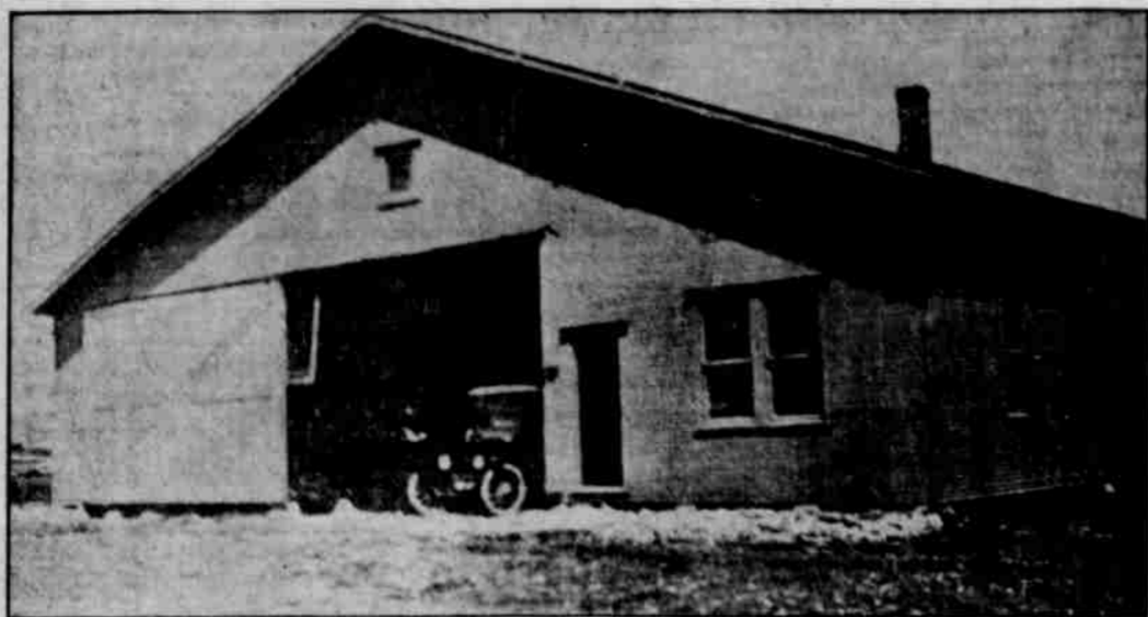
NEW OFFICE AND SHEDS OF THE TUM-A-LUM