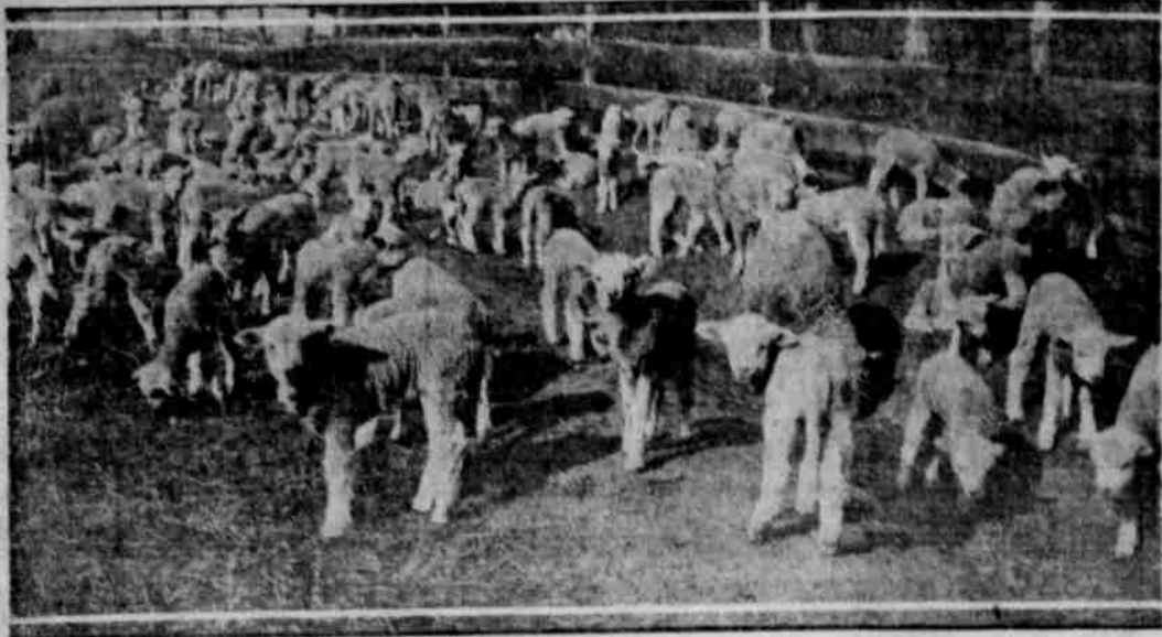
OUTLOOK FOR SHEEP MEN OF CENTRAL OREGON NEVER SO PROMISING AS FOR THIS SEASON.