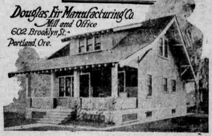
Douglas Fir Manufacturing Co Mill and Office 602 Brooklyn St. Portland, Ore.

and you Save 30% The factory way is our National way. It eliminates waste and makes possible a better product for less. Houses are no different from other products. With most of the labor performed in our mill, a big saving and a better house is the result. You get only selected Douglas Fir Lumber, world famous for durability and beauty. The house comes to you in one shipment. It saves the labor of building the ordinary, expensive way. It saves the waste of expensive material. And you can erect it yourself with unskilled help.