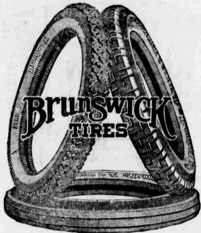
Cord Tires with "Driving" and "Swastika" Skid-Not Treads Fabric Tires in "Plain," "Ribbed" and "BBC" Skid-Not Treads

Sold On An Unlimited Mileage Guarantee Basis