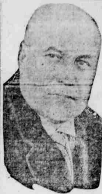
Franklin K. Lane, secretary of the interior, whose resignation has been accepted by President Wilson.

Seattle. Hay—Eastern Washington timothy, $38@39 per ton; alfalfa, $35. Butter Fat—66¢@72c. Eggs—Ranch, 38¢@40c. Poultry—Hens, dressed, 40¢@45c. Hogs—Prime, $15.75@16.35; medium to choice, $14.75@15.75; pigs, $12@13. Cattle—Best steers, $11@11.50.