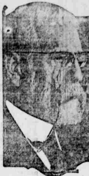
Robert Underwood Johnson, noted author and editor, who was recently appointed American ambassador to Italy.