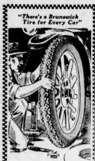
"There's a Brunswick Tire for Every Car"

Observation of Off Belt Philosopher A scientist has just discovered the fish are intelligent. We had observed also that they don't bite on everything that comes along.—Baxter Citizen.