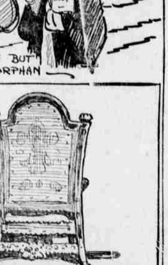
THE BACK OF DADDY-LONG-LEGS CHAIR