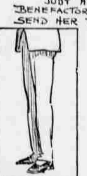
HOW DADDY GOT HIS NAME