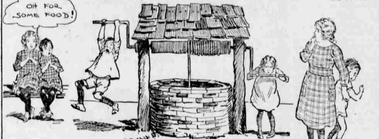
BROUGHT UP ON PRUNES, FEAR AND HARDSHIPS