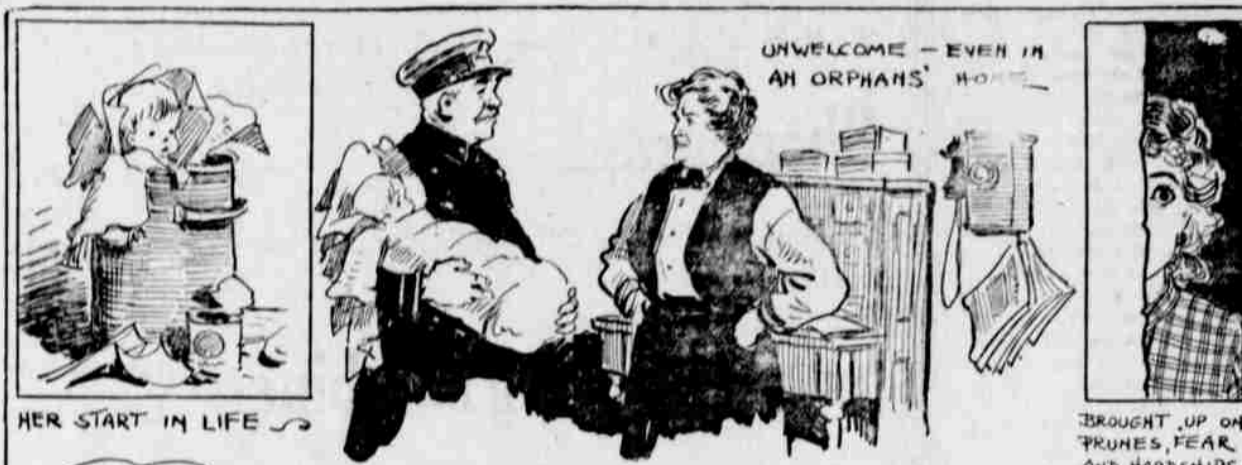
HER START IN LIFE