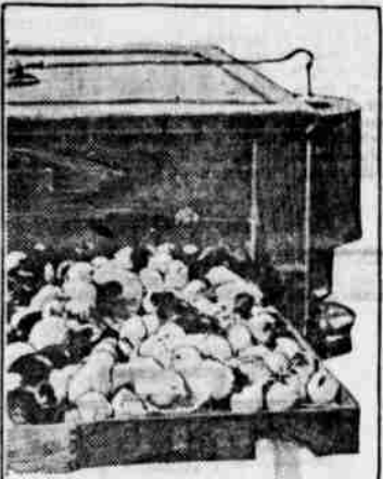
Hatching Season Demands Poultry Raiser's Most Careful Attention.

into the heat or ventilate the room or to supply fresh water. Keep charcoal, grit, etc., before them all the time, or when needed. They naturally love to scratch, and if given a chance will make the litter fly in digging after tiny morsels. Keep them scratching. This can best be done by not overfeeding. Have an outside room that is a little colder than where the brooder is kept, or put the brooder in one side of the building or room. This will leave the other side cooler. Remember that sweating or damp brooders or houses are more dangerous to chicks than cold; but chicks must have a sufficiently warm place to hover whenever they wish.