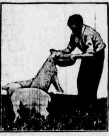
A Club Boy and His Three Orphans.

Many weak "orphan" lambs and pigs, requiring too much care for the average farmer or ranchman to bother with, are salvaged by the boys and girls belonging to the clubs organized by the United States department of agriculture and the state colleges. Patience, care and good nursing by a