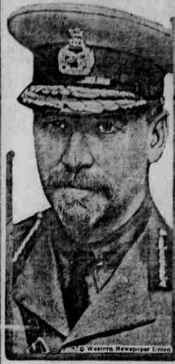
Gen. Jan. C. Smuts, South African delegate, who objected to certain conditions in signing the peace treaty.