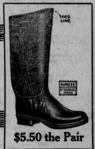
$5.50 the Pair