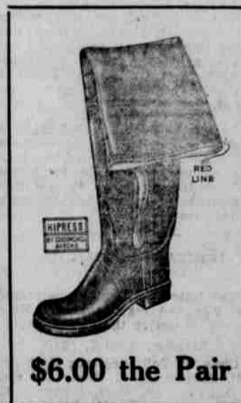
$6.00 the Pair