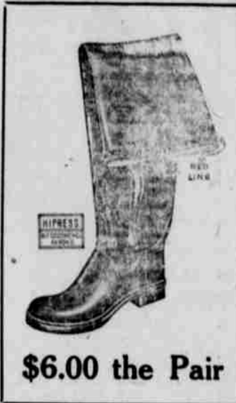
$6.00 the Pair