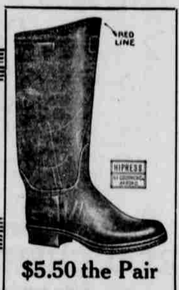
$5.50 the Pair