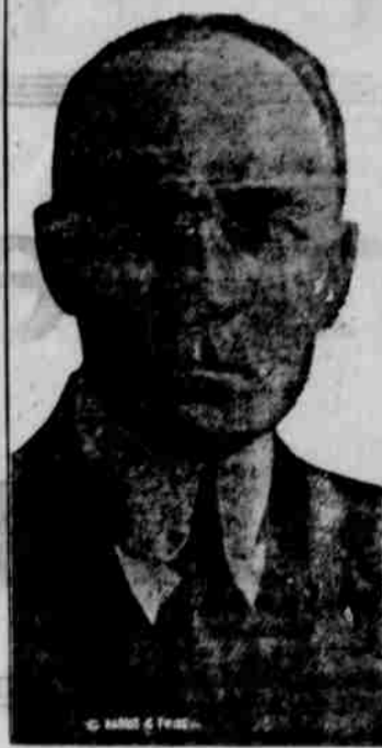
Walker D. Hines, who succeeded W. S. McAdoo as director-general of rail roads.