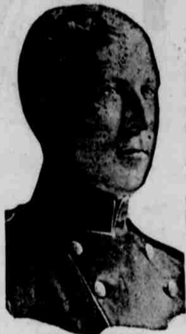
King Albert of Belgium, who received an enthusiastic welcome when he returned to Brussels after an absence of four years.