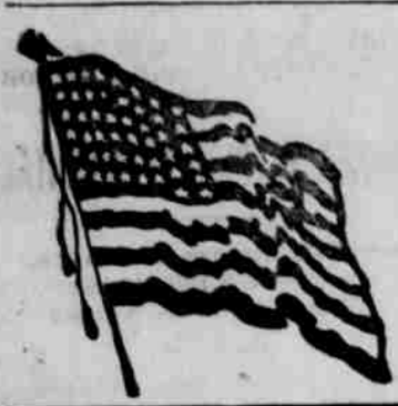
WHY NOT PLAY SQUARE POLITICS?

Why can't the Portland Journal play a square game in politics? Why not lay all the cards on the table; tell the voters the whole truth instead of camouflaging the points the voters should know, in considering the pro-posed delinquent tax bill amendment.