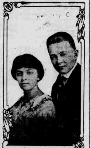
THE WASSER COMPANY.