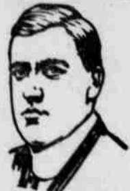
REX BEACH Famous Author, says "I have smoked Tuxedo in sub-Arctic Alaska, at Panama, and everywhere—would not smoke another kind."

Among the world's great story tellers, those gifted, entertaining feilers, Rex Beach is stacking high; and I am always in my glory when I have got a new Beach story; it suits me more than pie. Red blood in all his yarns is seething; his characters are living, breathing, not dummies made of wood; strong men admire his kind of writing, of heroism, peril, fighting—it's always to the good. And Rex, when he is busy working, his trusty old typewriter jerking, until it busts a spoke, to have his inspirator quickened keeps all the air around him thickened with rich Tuxedo smoke. Say, have you noticed, gentle readers, how many famous men and leaders explain Tuxedo's worth? As man's great solace they expound it, and that's because they all have found it the best there is on earth.