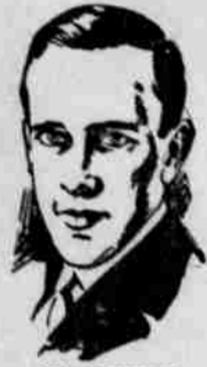
BUD FISHER Famous Cartoonist, says: "Tuxedo has made a pipe my favorite form of smoking. Its coolness and mildness make pipe-smoking a real pleasure." Bud Fisher

Bud Fisher jumped the old-time rut when he invented Jeff and Mutt. For years, with that amusing pair, he's chased away the people's care, and made them laugh and throw their hats, and cackle till they broke their slats. The tired, the sad, the weak, the worn, have laughed with Bud, and ceased to mourn; the lame, the halt, the blind, the deaf, have whooped with glee o'er Mutt and Jeff. Where does he find the joyous jests which break the buttons from our vests? You'd think the fount would have to fail, but never once has he been stale. When he sits down to hatch a plot in which his heroes will be caught, he lights his pipe, and soon a joke emerges from Tuxedo smoke. He swears by "Tux" and so will you, when you have tried a jar or two.