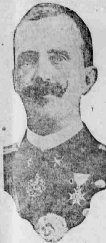
Victor Emmanuel, King of Italy, who signed a decree giving the ministry power to make war on Austria-Hungary.