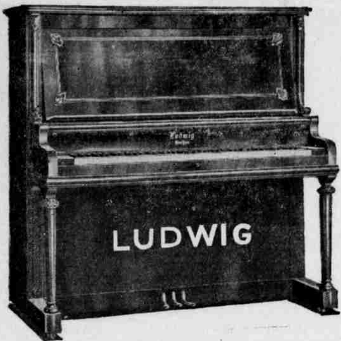
$430.00 Ludwig Piano

The first grand prize, which will be given away absolutely free to the person having the greatest number of votes at the close of the contest, is a style B Ludwig piano. It is finished in mahogany, and has a stool to match.