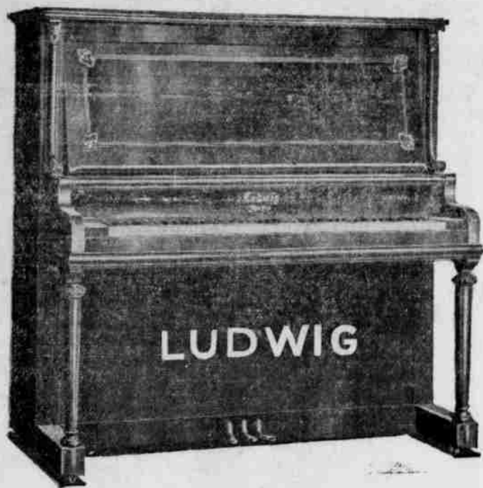
$430.00 Ludwig Piano

The first grand prize, which will be given away absolutely free to the person having the greatest number of votes at the close of the contest, is a style B Ludwig piano. It is finished in mahogany, and has a stool to match.