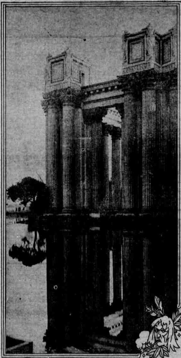
Curving 1,100 feet around the foliaged shores of the Fine Arts lagoon, Panama-Pacific International Exposition, these mighty pillars are reflected, mirror-like, in the limpid waters of the lagoon, affording one of the prettiest views at San Francisco's great Exposition.

ATTRACTIVE BOOK ON THE PANAMA-PACIFIC INTERNATIONAL EXPOSITION AND PANAMA CANAL MAILED FREE.