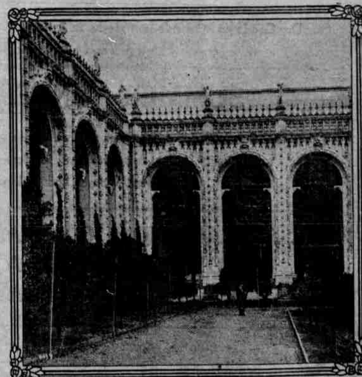
View showing section of colonnades, Court of Abundance, Panama-Pacific International Exposition, San Francisco. The lavish oriental embellishments of this court are well portrayed in this photograph.