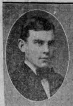
Who was on Monday appointed United States Commissioner