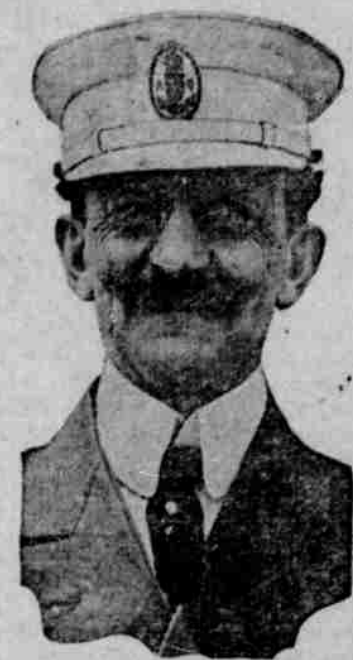
Count Von Bernstorff, German Ambassador to the United States, who has a difficult position, owing to war complications.