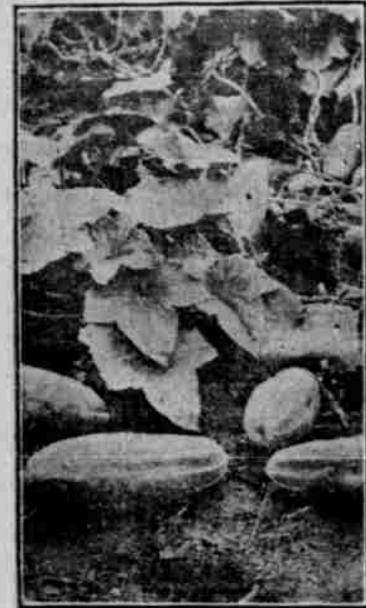
CUCUMBER TROUBLES ARE BEING INVESTIGATED.

These injuries have proved upon investigation to be due to one or another of several distinct troubles—blighting of the foliage by downy mildew or anthracnose, diseases which have already proved controllable by spraying with bordeaux mixture; to the bacterial wilt, a disease the cause of which is known and for which a remedy is being sought; to the pickle spot, a disease of sporadic occurrence and