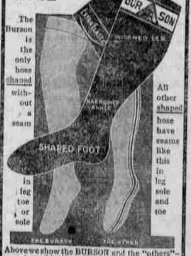
Above we show the BURSON and the "others" turned inside out-note the difference.