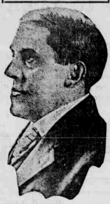
C. S. Osborne, ex-Governor of Mich igan, who is seeking the nomination for United States Senator.