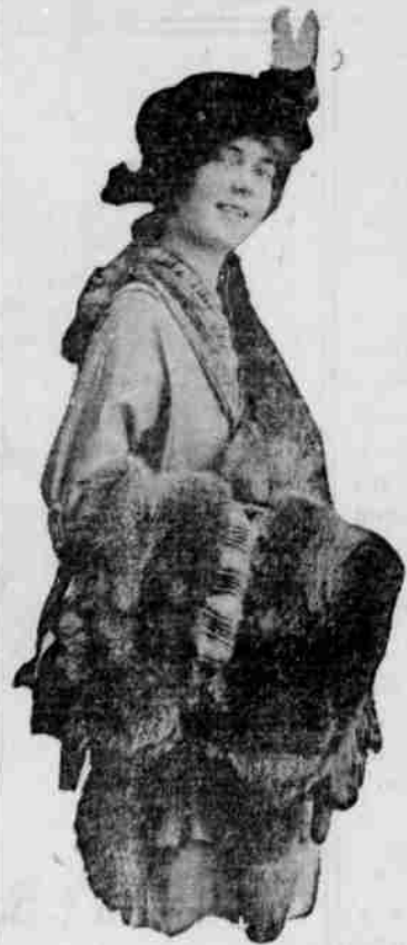
SET OF POINTED FOX WITH STRIPED SILK

There is something very barbaric in the arrangement of fashionable furs.