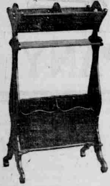
PORTABLE BOOK RACK.

This novelty usually takes the form of an elaborately dressed manikin, whose full skirt is mounted on a wire